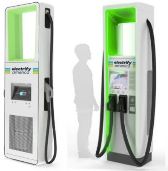
Example Charger Rendering

To construct 400+ community and highway corridor charging stations planned in California during Cycle 1, thousands of station sites must be considered. With the assistance of JLL and in cooperation with real estate partners and utilities, hundreds of station locations entered the Electrify America's field and real estate review process, which is focused on finding station sites that are accessible, safe, and visible, with proximity to retail and appropriate power capacity. Hundreds of stations proposed to Electrify America through submissions made during implementation of the National Outreach Plan are under review.