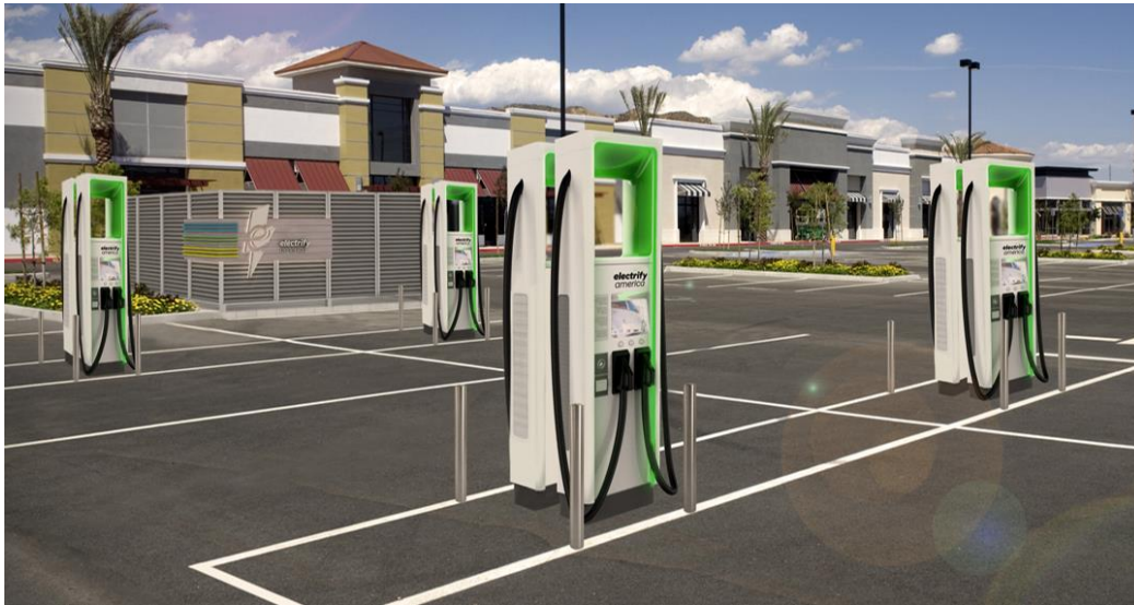
Example Charging Station Rendering

Through contract terms and site selection processes, Electrify America continues to strive to ensure that 35 percent of stations are located in disadvantaged or low income communities.