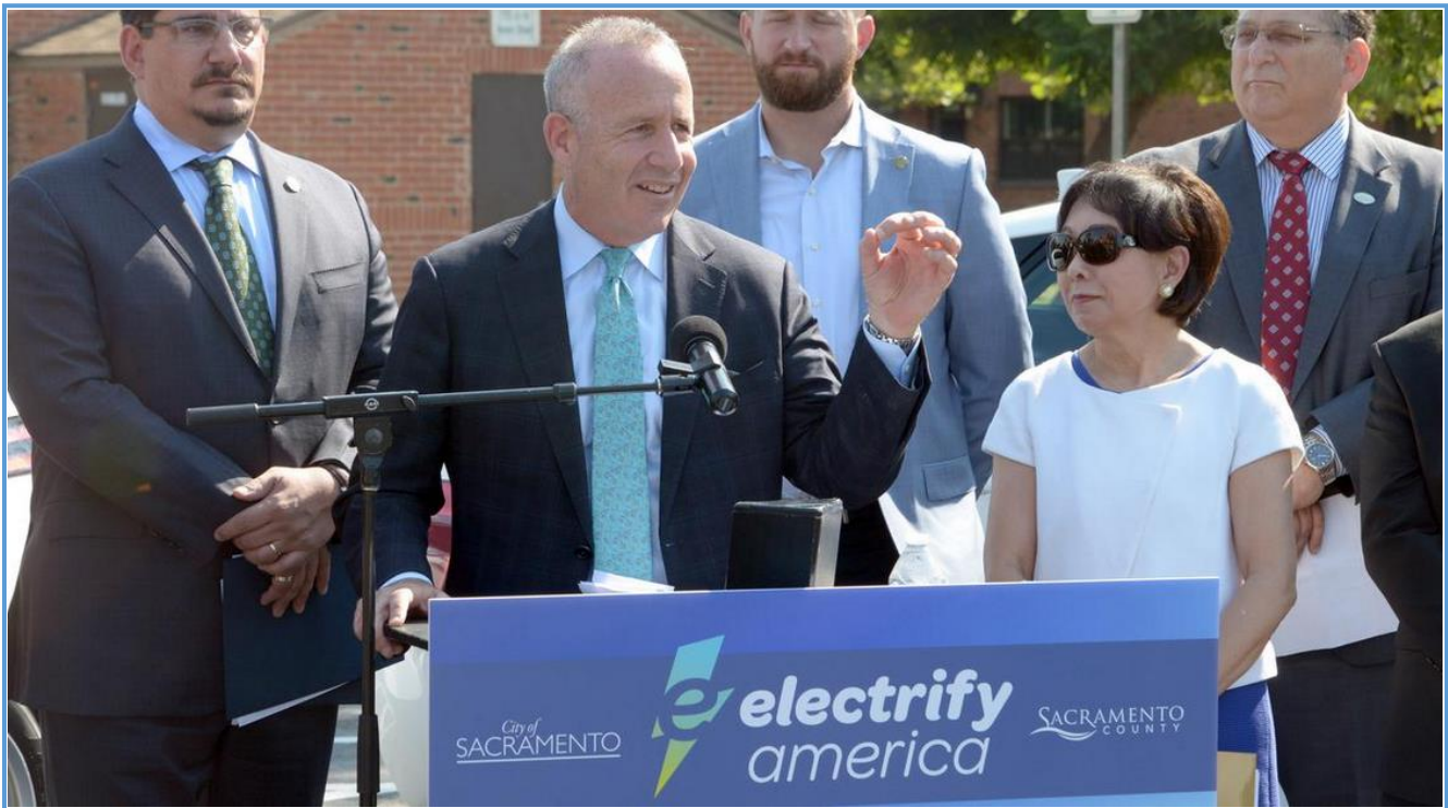
Green City launch event in Sacramento

In August, Electrify America, the City of Sacramento, Sacramento County, Sacramento AQMD, Congresswoman Doris Matsui, and many other pillars of the Sacramento community celebrated the official launch of the Electrify America Green City Initiative. Electrify America also announced that it plans for carshare services to be the first of its Green City initiatives. An RFP for carshare services was shared with qualified vendors in Q3, and multiple innovative responses were received. Electrify America, the City of Sacramento, and other stakeholders also began evaluating additional programs consistent with the Green City Initiative's access and innovation goals in Q3.